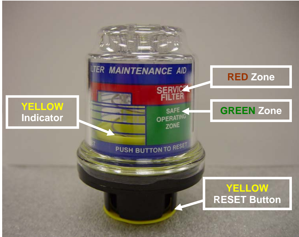
Figure 2-1. FILTER MAINTENANCE AID – (ABOVE) “YELLOW Indicator” position relative to SAFE OPERATING ZONE (“GREEN Zone”) or SERVICE FILTER (“RED Zone”) markings defines current filter condition and pushing “YELLOW RESET Button” resets indicator. (BELOW) FMA unit is mounted on the outside of the inlet cowling and can be viewed by opening the inspection door.